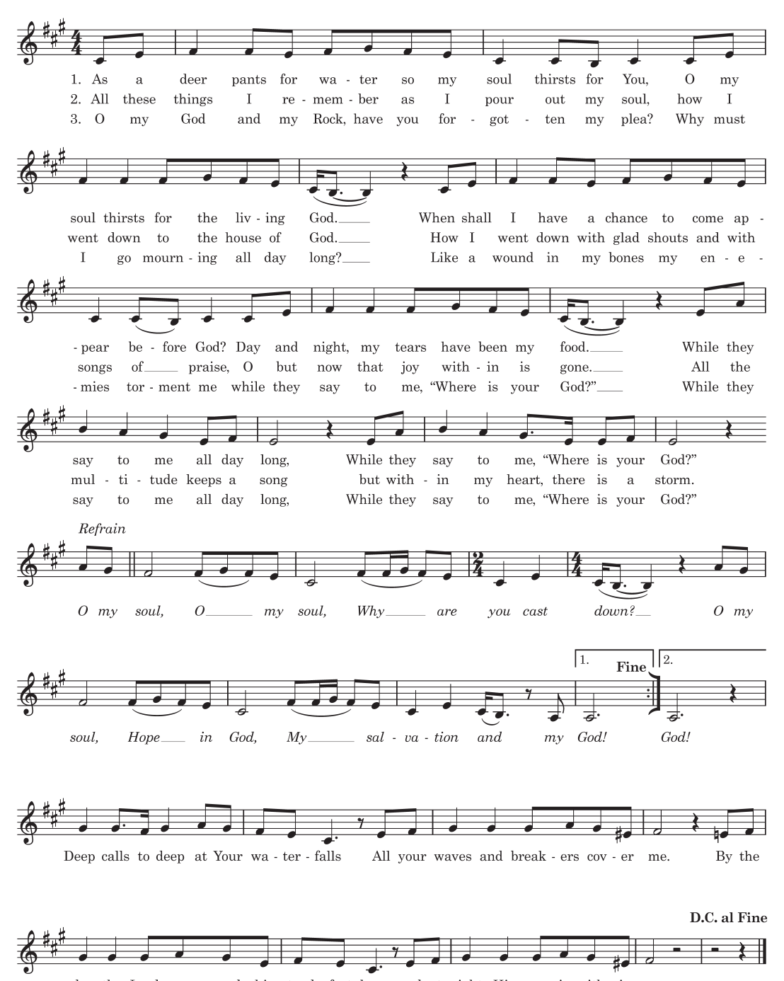
day the Lord com - mands his stead - fast love, and at night, His song is with - in me.